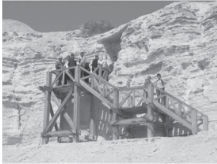
Fig. 7. The caves of the monks dug in the natural lissan marl

The natural threats on the discovered buildings of Bethany Beyond the Jordan could be classified as two types: