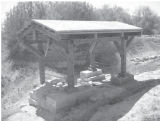
Fig. 3. The small church close to the Jordan River

If the foundations of the buildings are not insulated from damp ground, water is drawn into the structure by the permeability. The height that water can actually reach in a structure is influenced mainly by the balance between the underground water and the evaporation from the