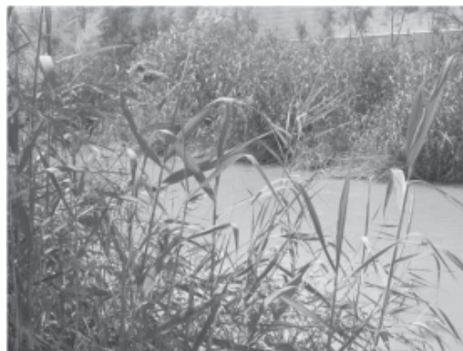
Fig. 6. The traditional spot of Baptism (Jordan river)

Several strains of bacteria draw the energy necessary for their vital activities from inorganic chemical reactions of reduction or oxidation which they have the ability to produce. Such reactions can result in the formation of acids,