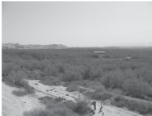
Fig. 5. The ecology of Bethany Beyond the Jordan and John the Baptist church.

The expected density of traffic in this area will witness much polluted air that increases the Sulphur dioxide SO_2 ratio and the carbon dioxide CO_2 present in the atmosphere (Van Grieken 2010; Grzywacs 2006).