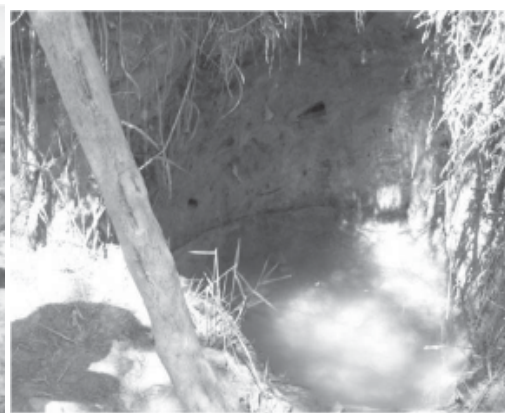
Fig. 4. Spring of John the Baptist in the heat of Bethany Beyond the Jordan